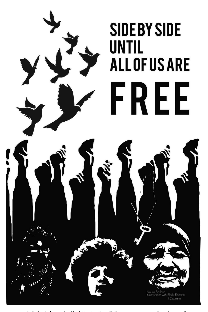
FIGURE 2. Side by Side until All of Us Are Free. "This image was produced out of a joint struggle between Black for Palestine and the Z Collective in 2016 and represents Black and Palestinian cultural and political solidarity, toward an understanding that true justice cannot be found unless there is an intentional justice for all."